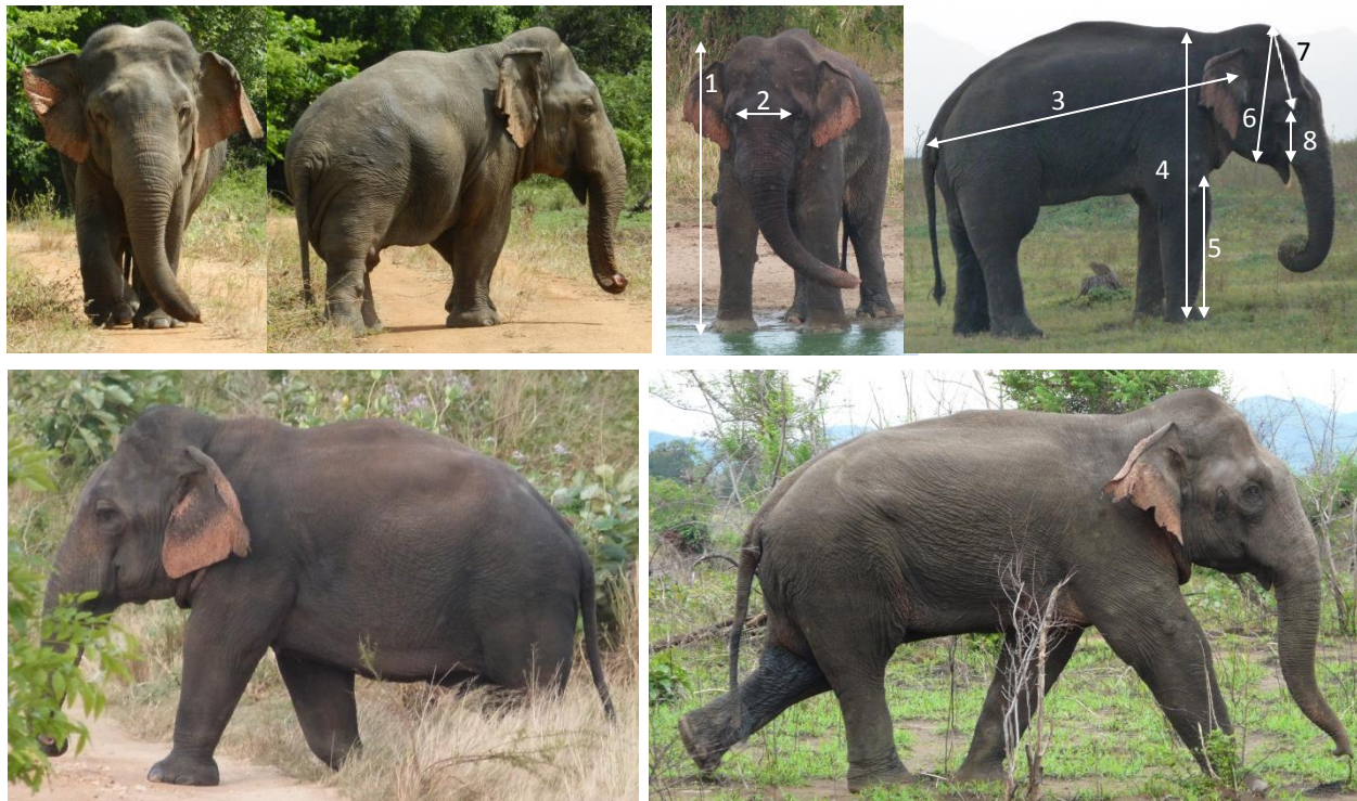
Fig. 2: Dwarf M429 and wild type adult male M054

M459 (left) proposed dwarf, compared to M054 (right) a typical mature adult male. Numbers indicate ratios given in Table 1 (see methods) as follows: 1) Head to foot; 2) Width between the eyes; 3) Body length from base of tusk to ear canal; 4) Shoulder height; 5) Foreleg length; 6) Top of skull to chin; 7) Top of skull to eye; 8) Eye to tusk sheath