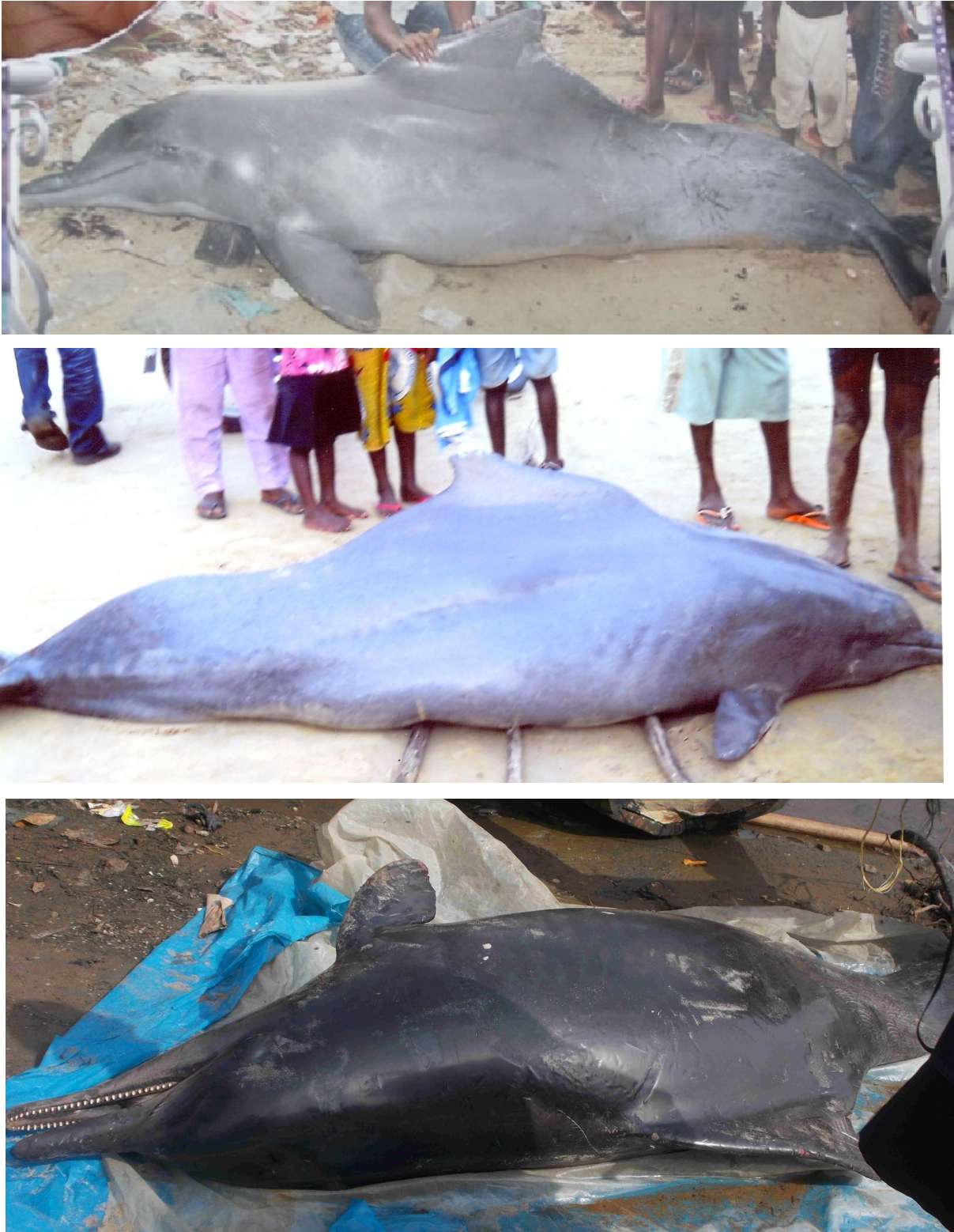
Figure 5. Atlantic humpback dolphins captured in artisanal coastal fisheries. (A) Juvenile landed at Imbikiri quarters, Brass Island, Nigeria, February 2012; (B) Adult specimen at Rotel fishing settlement, Nigeria, in November 2011. (C) Freshly captured specimen landed at Londji landing site, Cameroon.