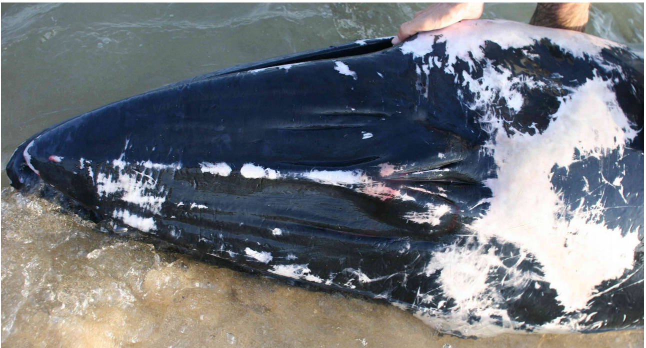
Figure 6. Dorsal view of head of QE22.09.2007 showing peculiar configuration of a relatively low central rostral ridge, a faint left lateral ridge and a system of two very short grooves, proximally, on the right side of the rostrum, providing a general aspect of incomplete and faint lateral ridges. The rostrum was largely flat and not slightly arched in cross-section as in minke whales.