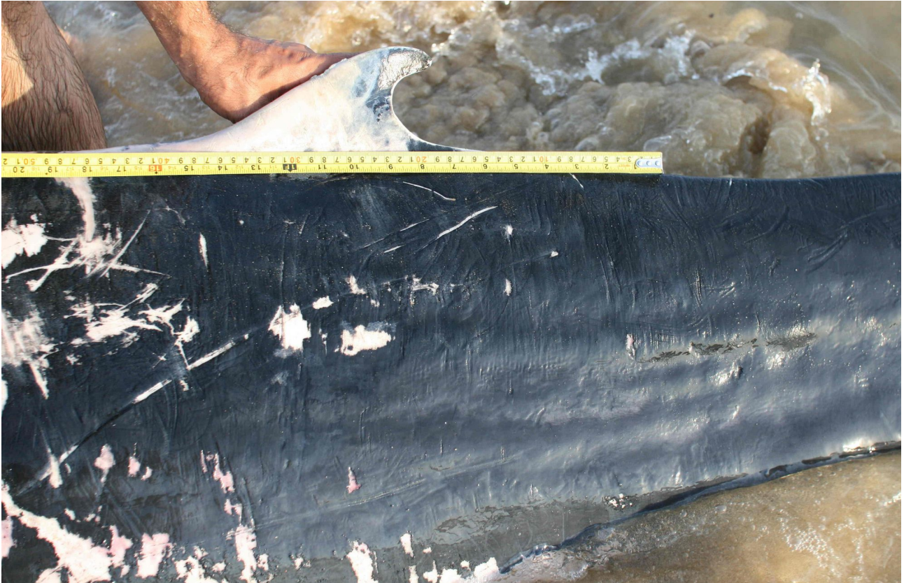
Figure 3. The strongly falcate, but relatively low, dorsal fin of QE22.09.2007, with tip pointing backwards seems a consistent characteristic for B. omurai . Indications are that the recurvedness accentuates with growth.