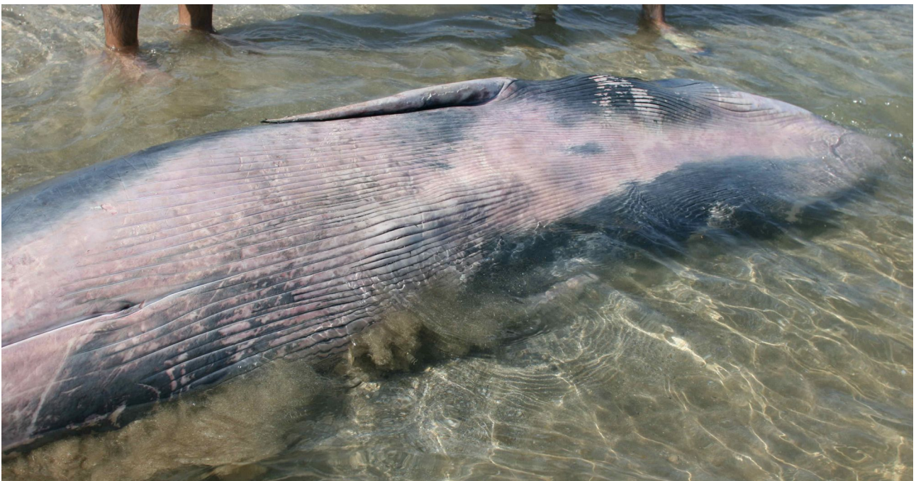
Figure 2. Ventral view of specimen QE22.09.2007, showing diagnostically large number of throat grooves (n=82), which extended caudad of the fully healed umbilicus. Note also the asymmetric ventral colouration pattern (see text).