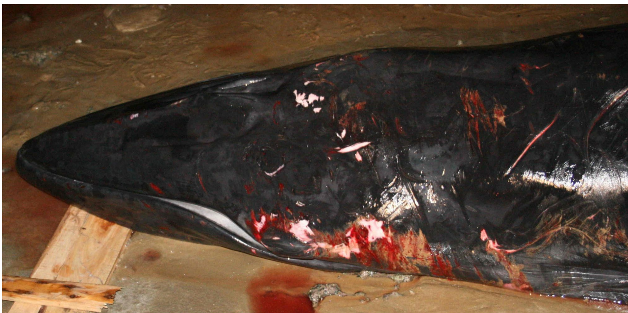
Figure 5. Overall dark pigmentation of the left body side of specimen QE22.09.2007, and in particular the uniformly darkly pigmented throat and left mandible contrasts with its paler right side (Figure 4). However note lighter pigmented left gape.