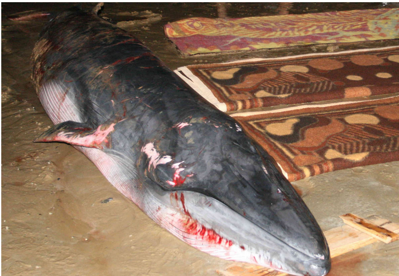
Figure 4. Right side of QE22.09.2007 while still alive, showing lightly pigmented, almost white throat, with light grey right mandible. Note three head stripes: (1) dark grey, wide eye stripe; (2) narrow ear stripe; and (3) wide flipper-to-flank stripe. Visible are also the central rostral ridge and two faint partial accessory ridges.