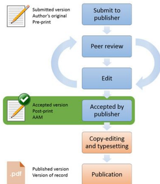
Figure 1. Publishing outline from HEFCE http://www.hefce.ac.uk/rsrch/oa/FAQ/

Following publication, however, the traditional scholarly communications process gives way to “best practices.” For concerns raised about an article, or author-initiated changes, there